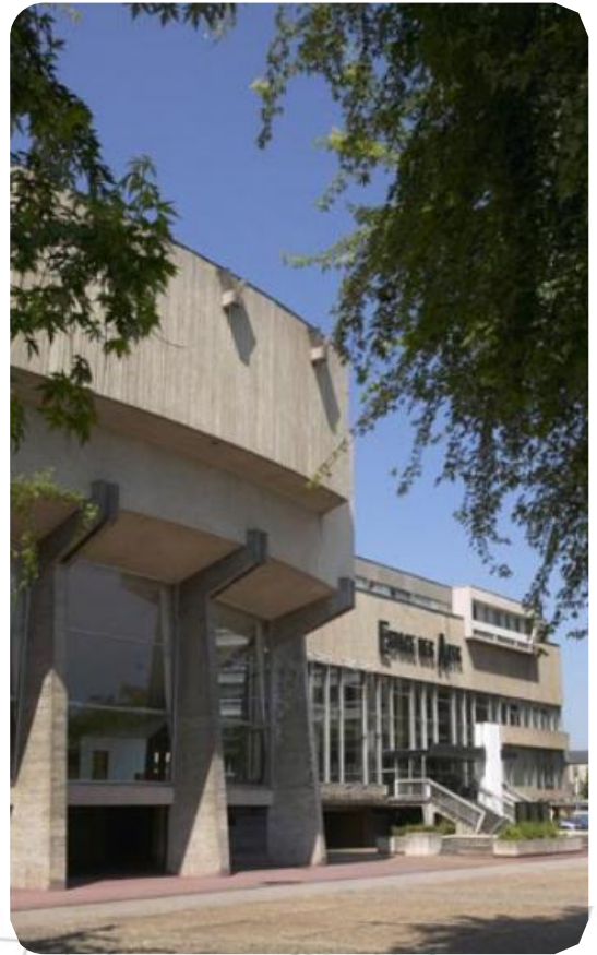
Espace des Arts de Châlon: main entrance

Espace des Arts hosts a large variety of events throughout the year, ranging from theater, dance shows, cinema, to live music, circus and concerts ... Its sound system has been renewed in 2013.