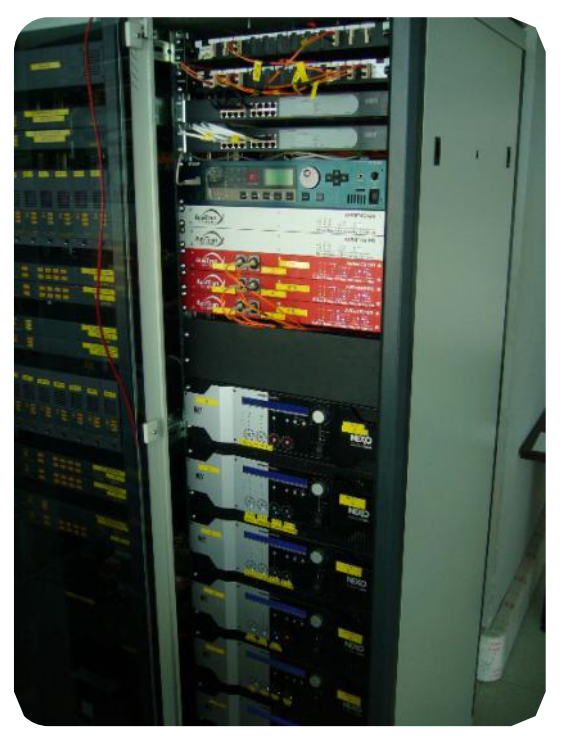
Nexo and AuviTran - the perfect combination for stadium applications