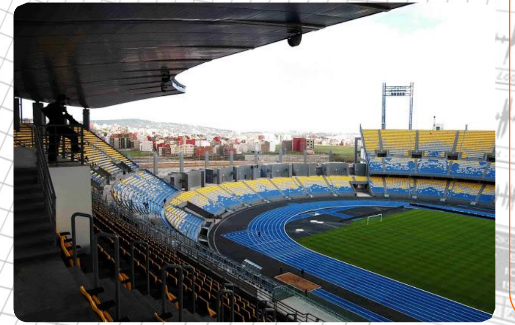
Tangier stadium: loud and clear sound !

AuviTran SARL—7c chemin des prés—F-38240 Meylan T: +33 476 04 70 69—info@auvitran.com—www.auvitran.com